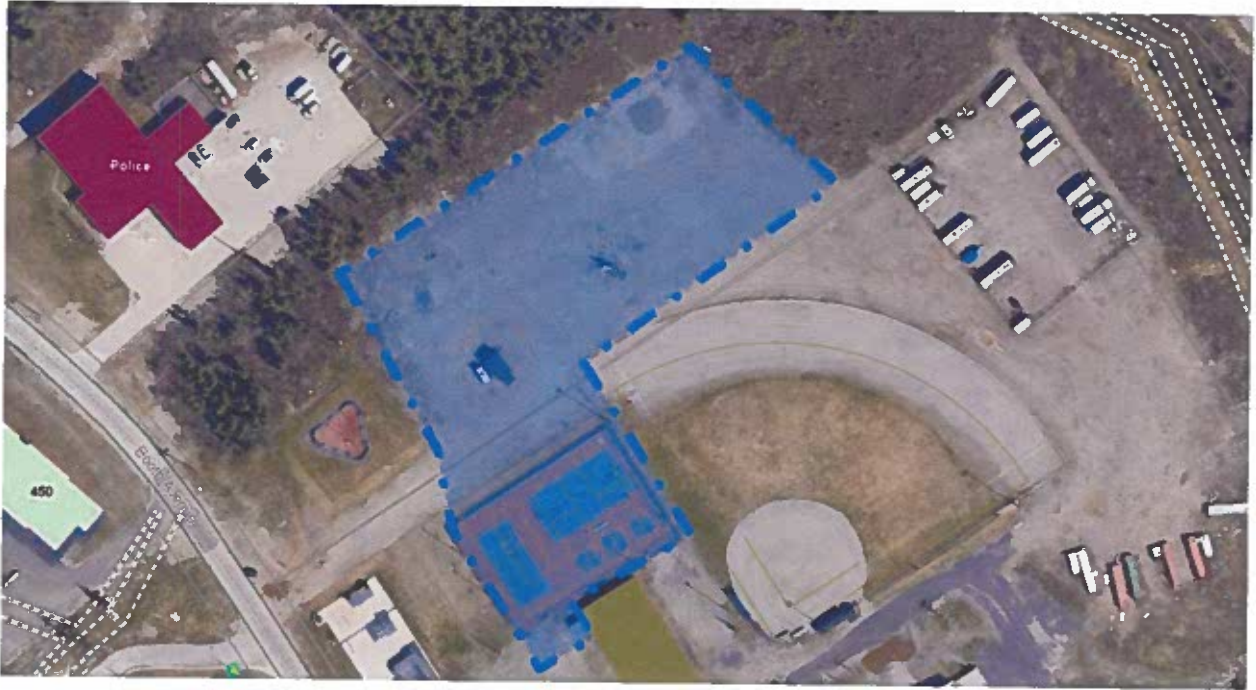
Figure 1 Licensed Area