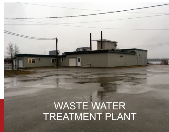
WASTE WATER TREATMENT PLANT